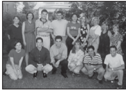
1998 English for Lawyers Program Participants and Faculty