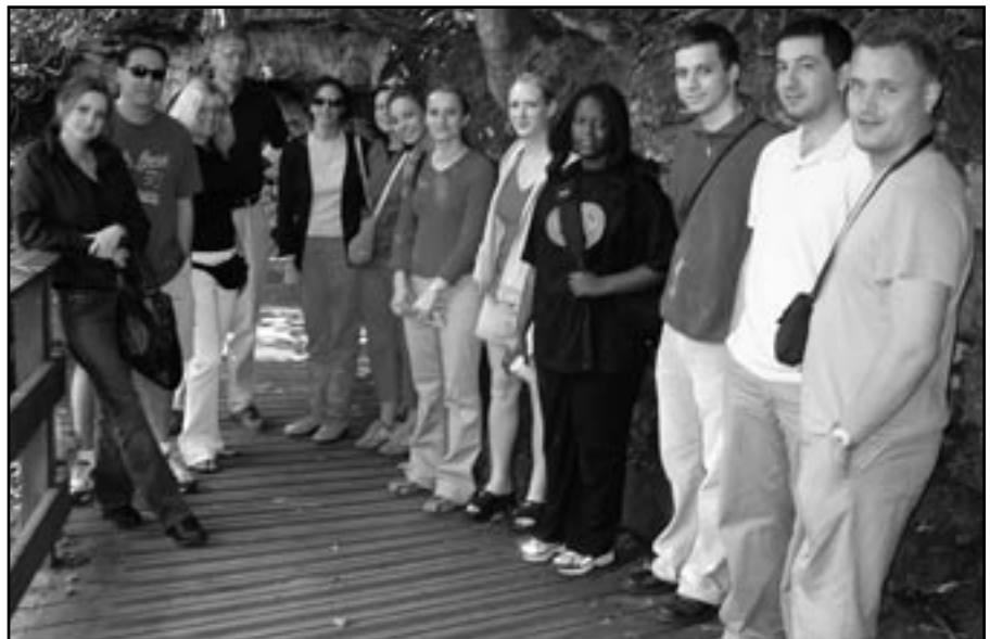
LL.M. Class of 2005 visits Frank Lloyd Wright's Fallingwater.