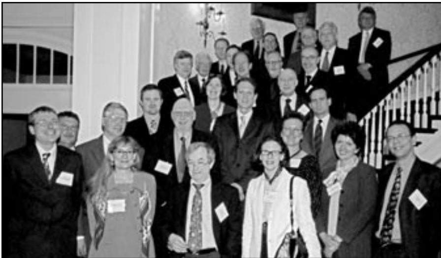
EU-U.S. policy conference participants.

One result of the conference will be a publication of papers based on many of the presentations. The conference was the fourth in a series sponsored by the University’s European Union Center through a generous grant from the European Commission. Previous policy conferences focused on issues related to immigration and criminal justice, aviation regulation, and e-Government.