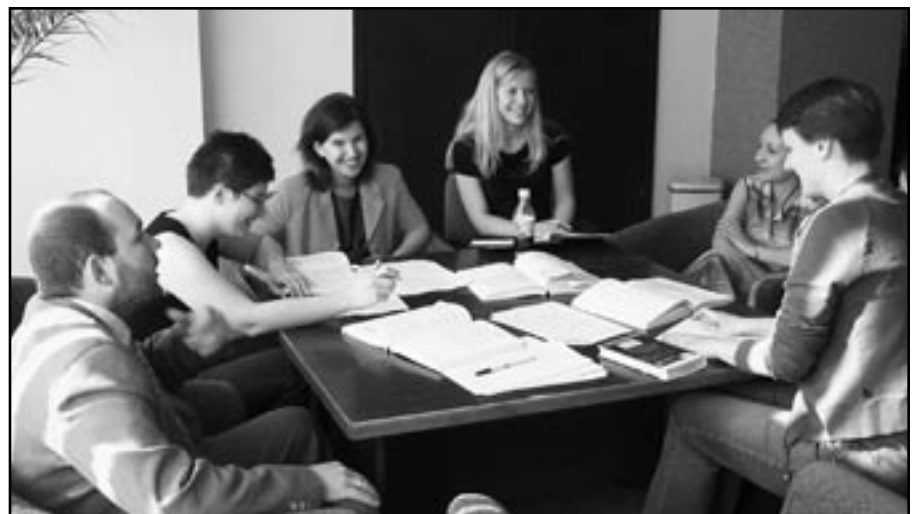
Polish EFL students working together.