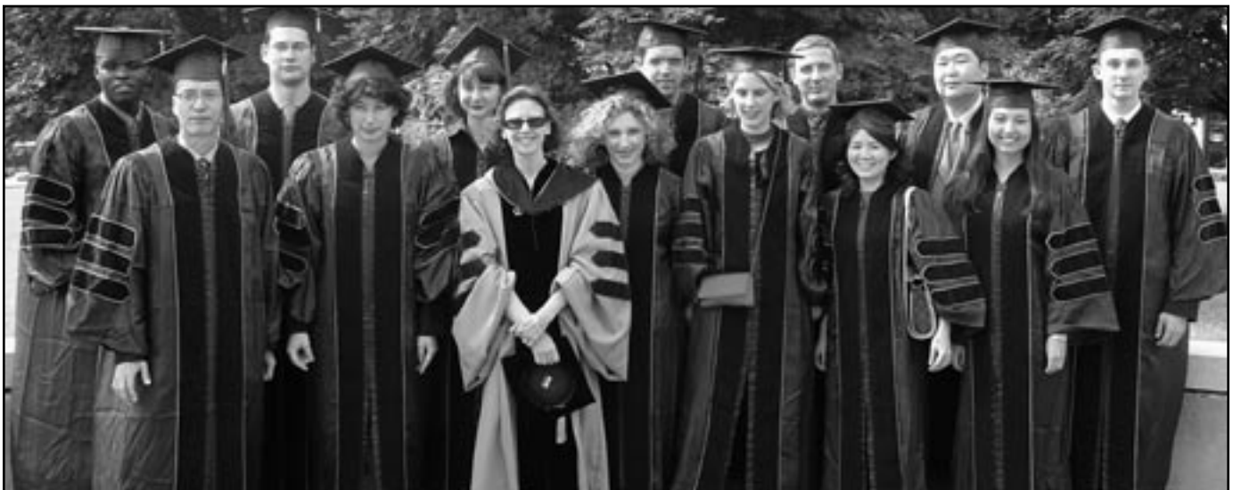
LL.M. Class of 2004.